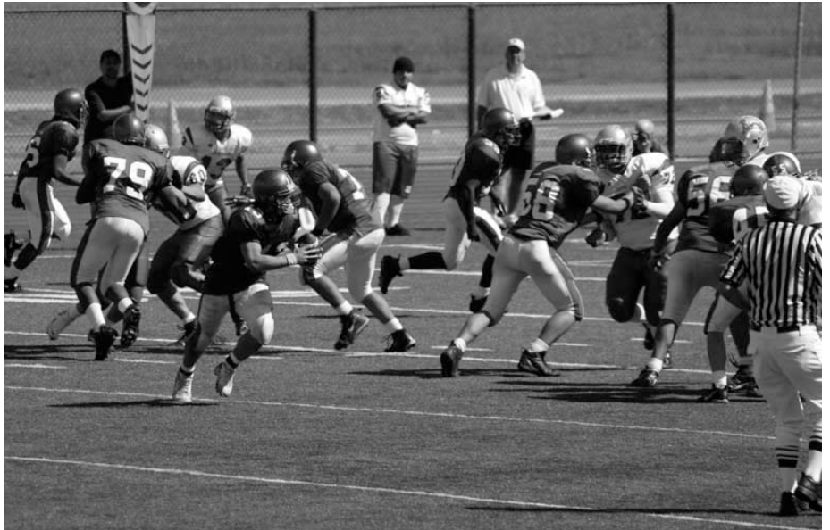
Tam Varsity on the offensive in their game against Justin Sienna.