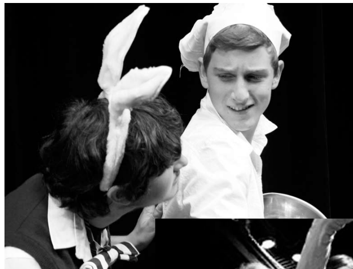
Students enjoy rehearsals for "Alice" playing November 6-10 at the Daniel Caldwell Theatre.