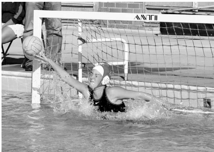
Top photo: Tam girls' varsity water polo team at the Contra Costa Invitational Tournament.

Future years should be bright for both teams as the junior varsity boys tied for first place and the JV girls came in second.