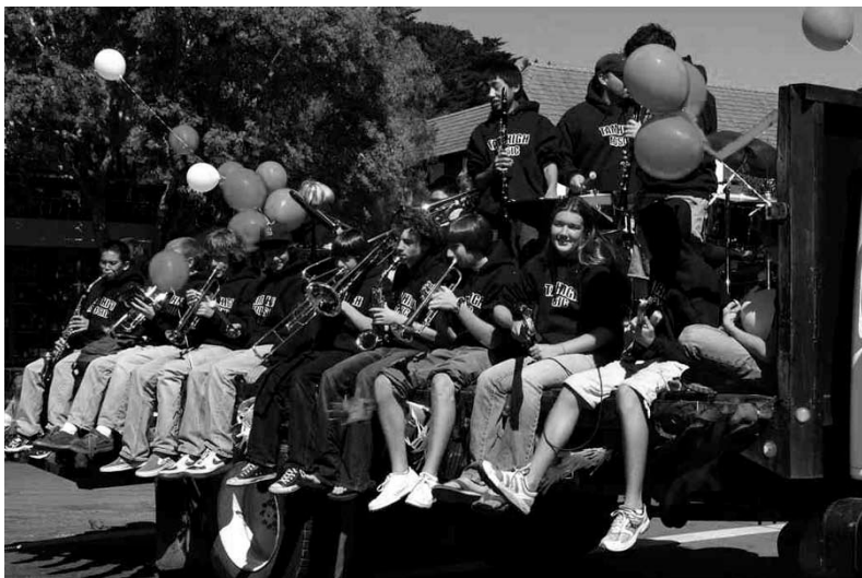
Members of the jazz band add music to the Homecoming Parade.