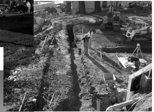
Lower Keyser footing excavation