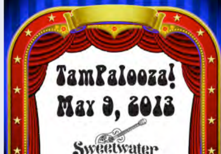
Tam High Foundation Spring Fundraising Event

Get your friends together and plan an evening of music, food and fun to benefit a great cause - our Tam High Student Center.