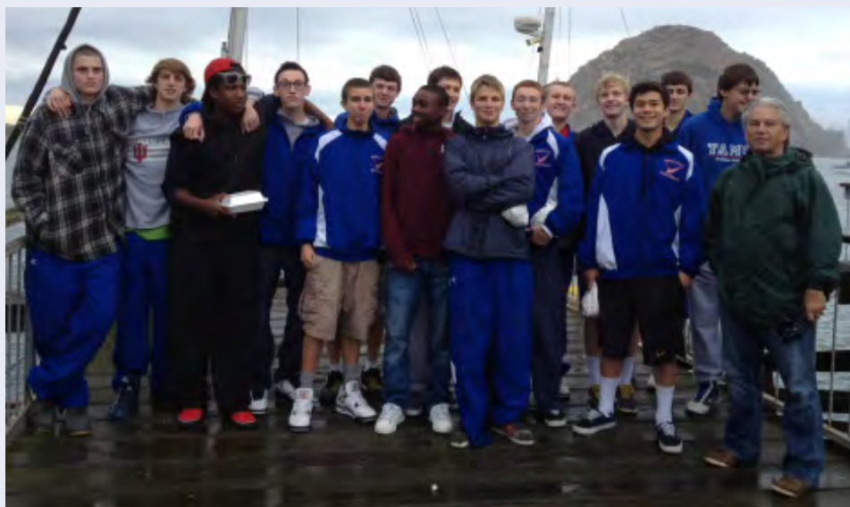
The Boys Varsity Basketball team at Morro Bay for the Harding Invitational Tournament. They won three of four games and enjoyed a great weekend of team bonding.